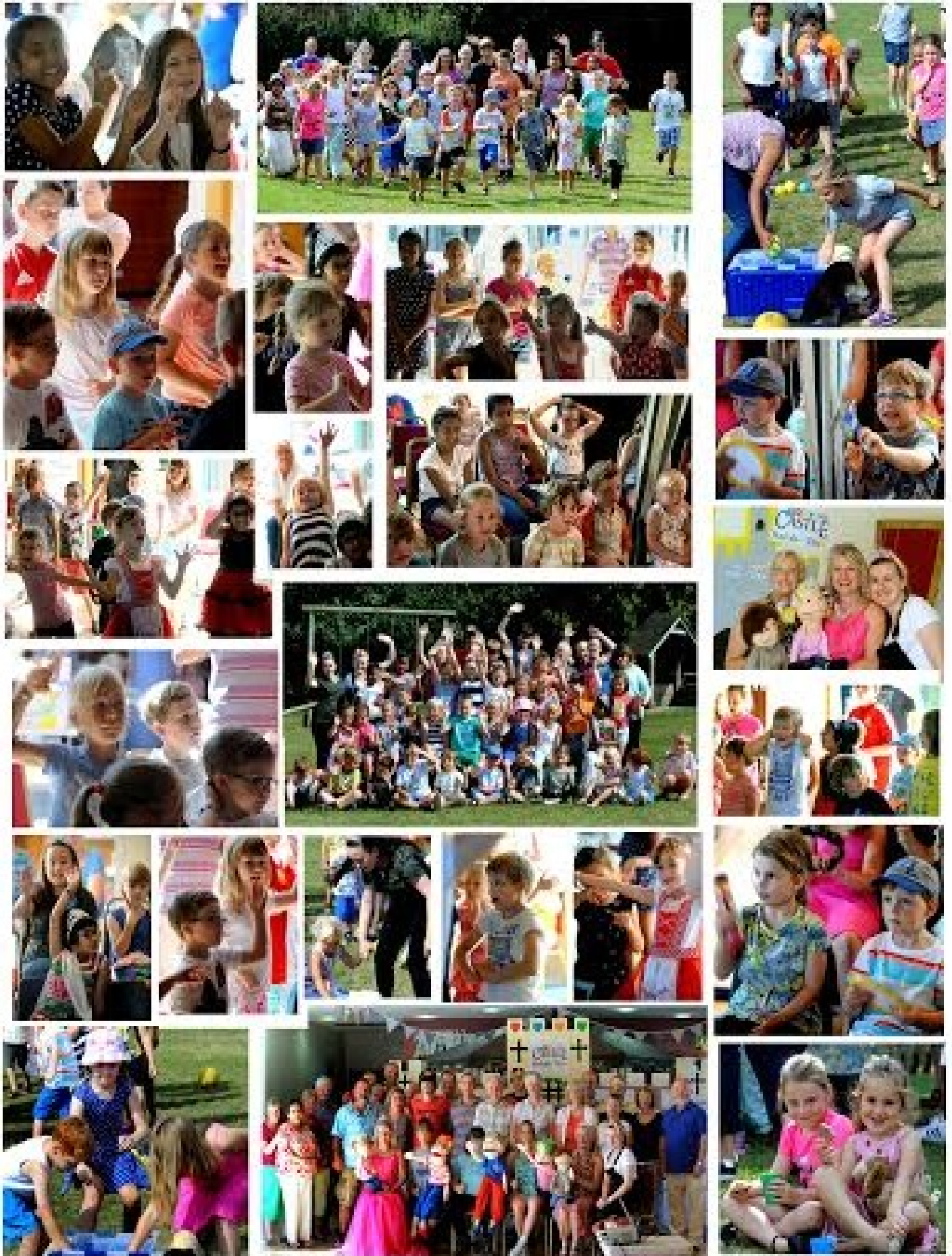
Kids of the Castle - Holiday Club